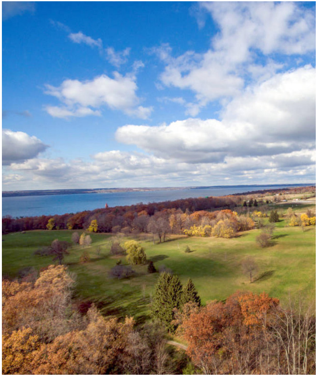
Lawns and Woods near Cayuga Lake